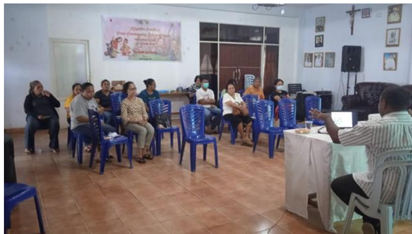
Figure 2. Workshop and discussion on implementing the 7P marketing principles.

mix material to optimize the business promotion of the KP business community. Ambon CU. Heart of Amboina Ambon Indonesia. In this community service activity, the 7P marketing mix principles were explained, which include product, price, place, promotion, people, process, and physical evidence. The 7P marketing principles are an expansion of the traditional 4P marketing mix concept (product, price, place, promotion) with the addition of three additional elements that focus on aspects more related to marketing services and customer experience. These principles are designed to provide a more comprehensive view of marketing strategy.