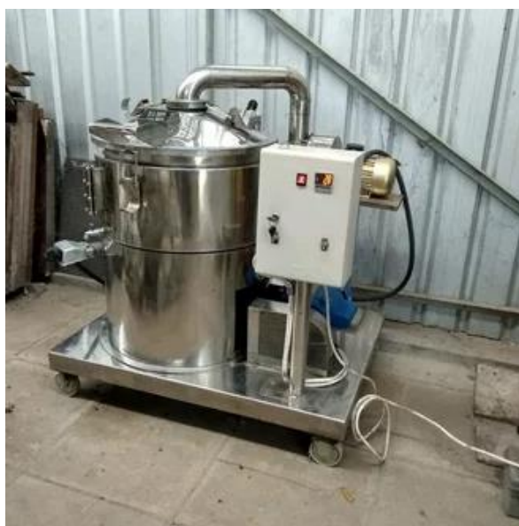
Figure 2. Extraction tool.

The extraction tool serves to perform extraction from simplisia so that concentrate extract is produced, as seen in Figure 2. The extraction tool has specifications, as seen in Table 1.